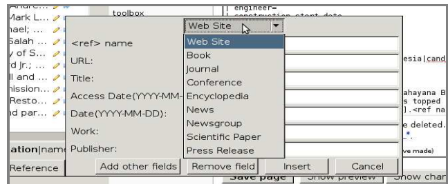
Figure 2. Adding a new reference to a Wikipedia article using Provelt's graphical user interface.

WikiSym 2009 as a forum by which to introduce many potential users to Provelt. We also wish to collect initial (informal) feedback from these users through Provelt demonstrations at the conference. Additionally, we will invite WikiSym attendees to install Provelt on their own computers to use at the conference and afterwards. Ideally, we will attract a critical mass of Provelt users and learn how to make Provelt more useful and usable.