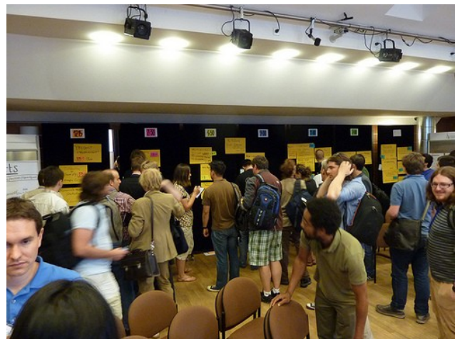
Open Space Marketplace, WikiSym 2010.

The WikiSym community also embraces open collaboration. Our wiki website enables the interactive participation of attendees and other interested participants. WikiSym also presents the Open Space , a special track with a free schedule that is lively designed by attendees. This represents an unparalleled opportunity to meet other people concerned about the same questions, challenges and goals, and discuss about them in small groups of interest, surrounded by a dynamic and welcoming atmosphere.