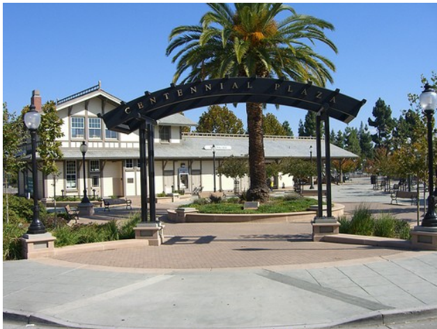
Centennial Plaza, Mountain View, California.

WikiSym is the International Symposium on Wikis and Open Collaboration, the flagship conference on open collaboration and related technologies. WikiSym is a 3-day conference aimed to offer a balanced mix between cutting-edge academic research works and ground-breaking industry solutions and services in this field. It covers a broad list of related topics including Open Educational Resources, social media, wikis and collaborative web technologies, knowledge and information production and management or free knowledge and licensing.