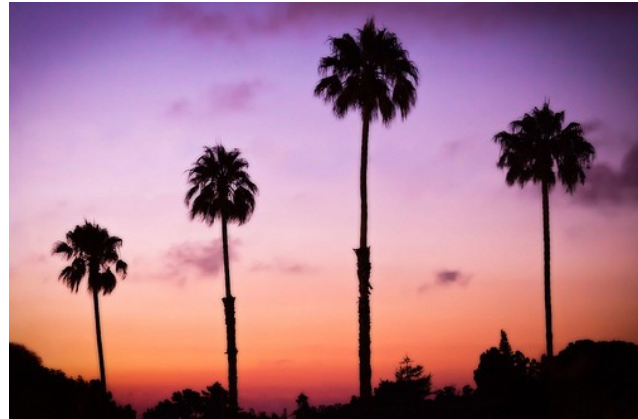
Sunset at Mountain View, California. By Benson Kua , taken from Flickr . CC-BY-SA 2.0 license.

for business and collaboration and presentation of new projects and initiatives.