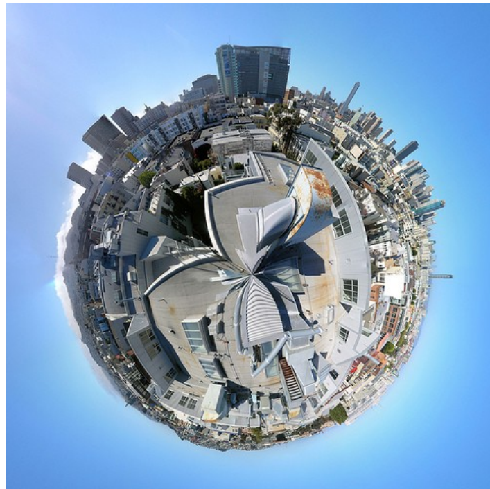
Wee Planet San Francisco from the Roof of Bolt.

Organizations contributing between $1,000 and $2,000 U.S. are recognized as WikiSym 2011 Friends on the sponsors page of the conference website.